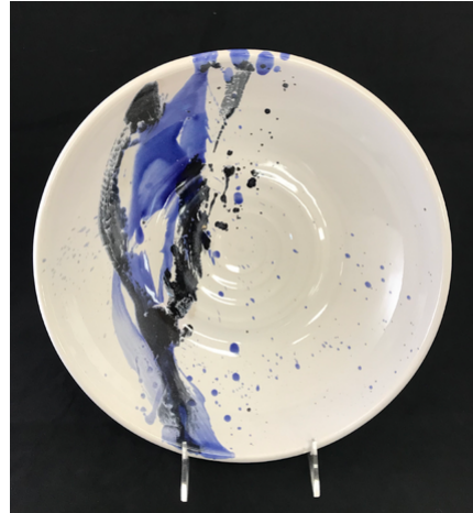
Pottery by Sloane Perroots

We quickly recognize contrasts in value, like the dark shadows on the snow in Kay's painting, or the blue and black design laid against a light ceramic background by Sloane. So also are contrasts in color: Kay's use of warm colors has made her cool colors look even cooler. Other types of contrast often go unrecognized, even though they may be doing some heavy lifting design-wise.