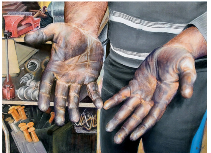
Hadi Aghaee - Working Hands Pastel Pencil - 11x14