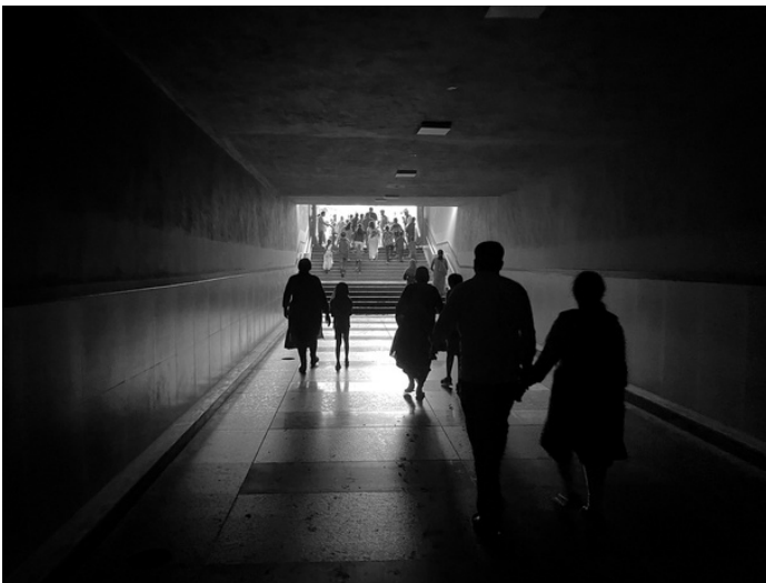
Sriharsha Annadore - End Of Pandemic Photography - 12x18