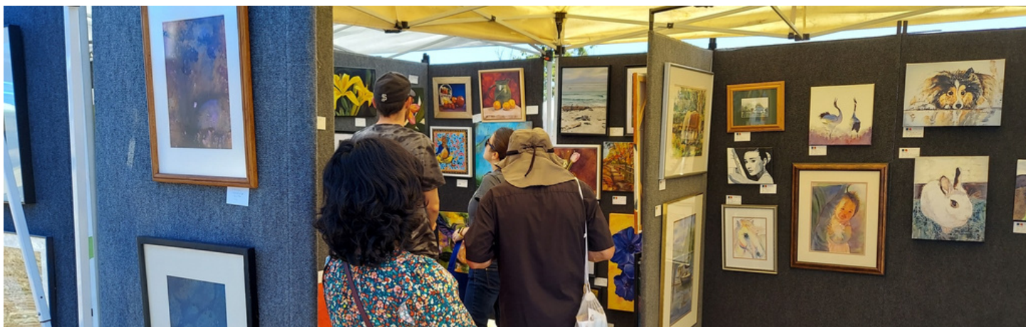
2023 Berryessa Art Festival