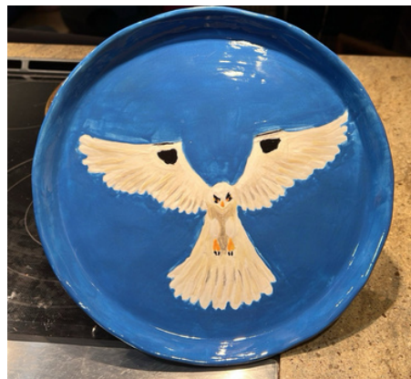
Julie painted a white-tailed kite