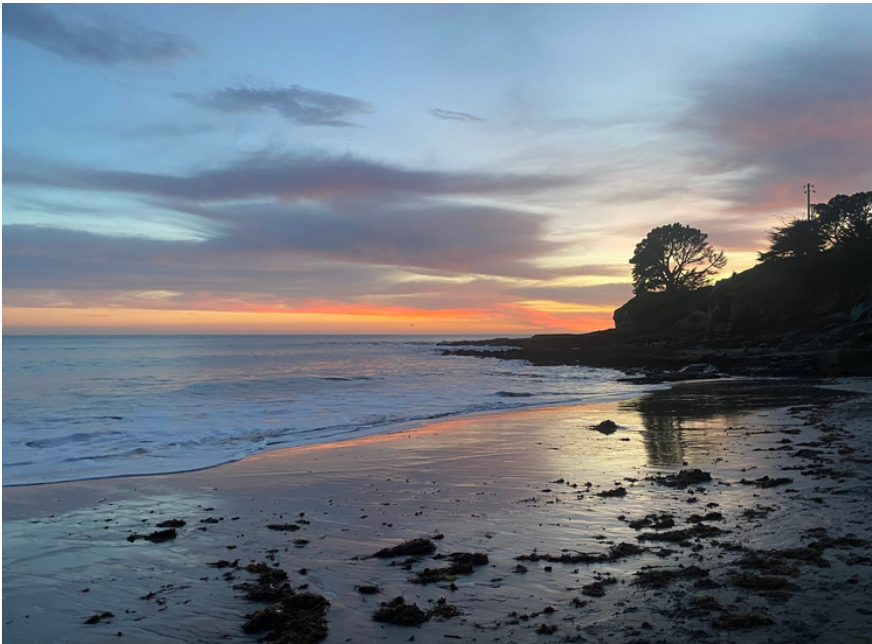
Carolyn Meredith - Just Before Dark digital photo, 8x10