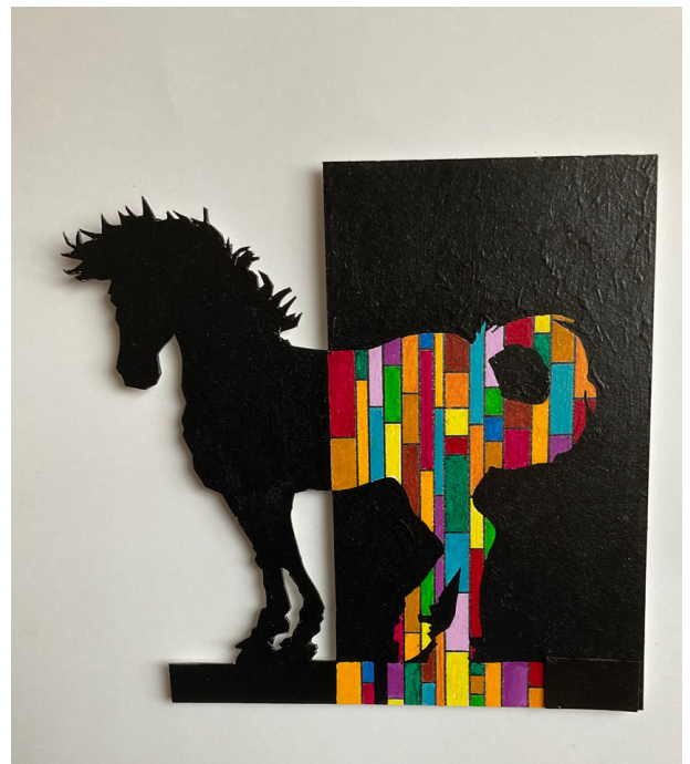
Wendell Fiock - Dreamcoat Stallion Acrylic, 8x10