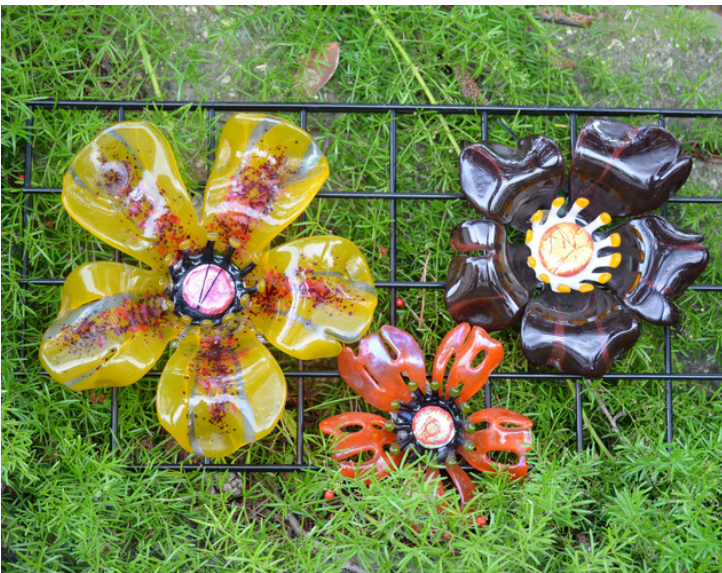
Carol Tillman - Untitled Fused glass flowers with dichroic glass centers