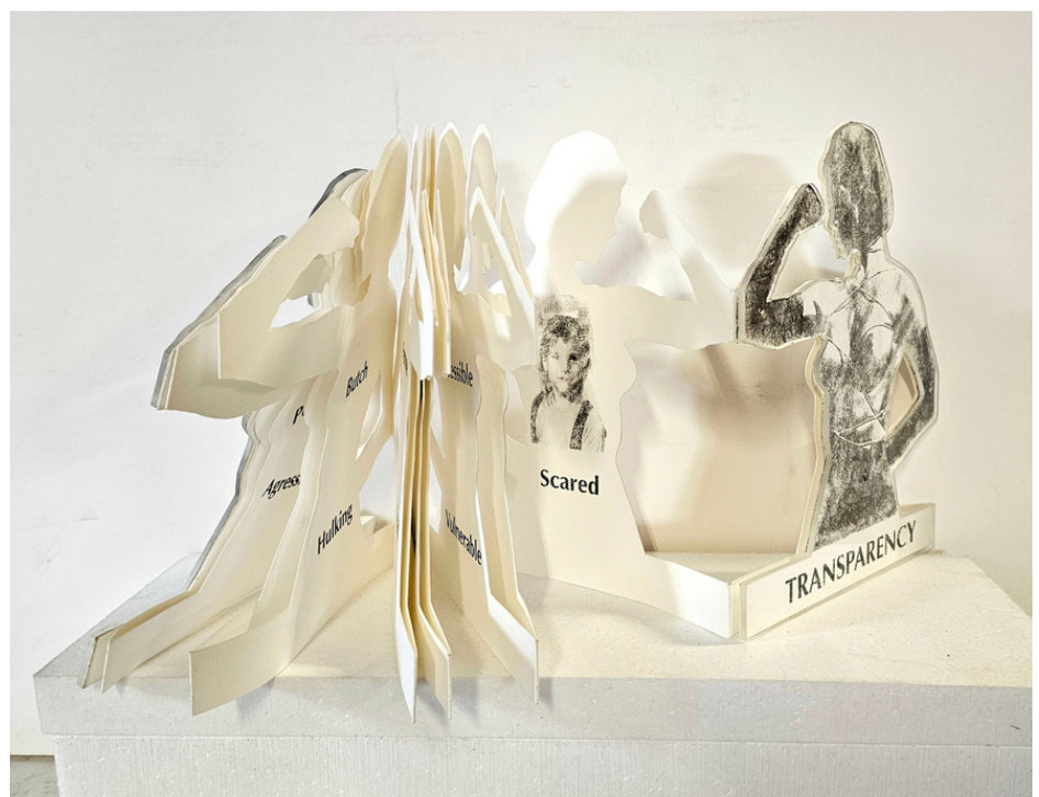
Carole Cameron - Facade / Transparency book, acrylic & paper