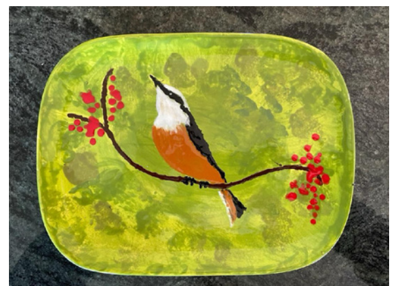
Judy painted a red-breasted nut hatch