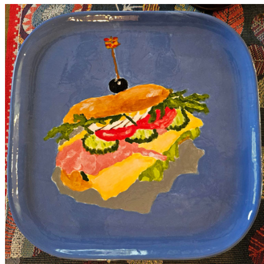
Carole's sandwich plate