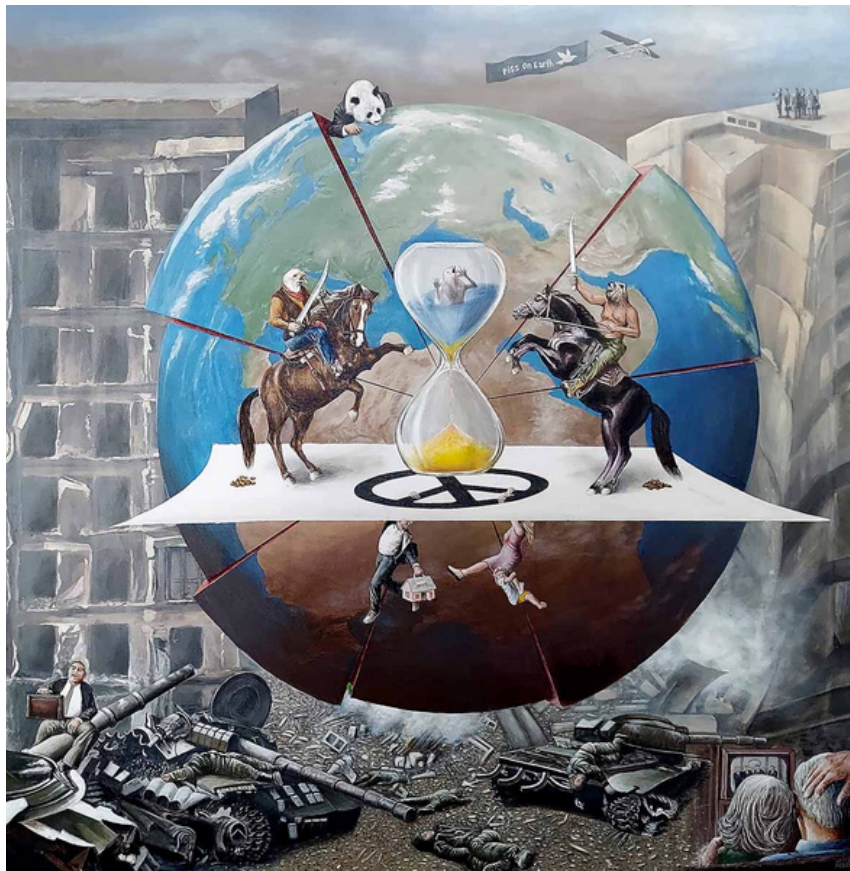
Hadi Aghaee - No Business Like War Business acrylic on canvas, 48 x 48