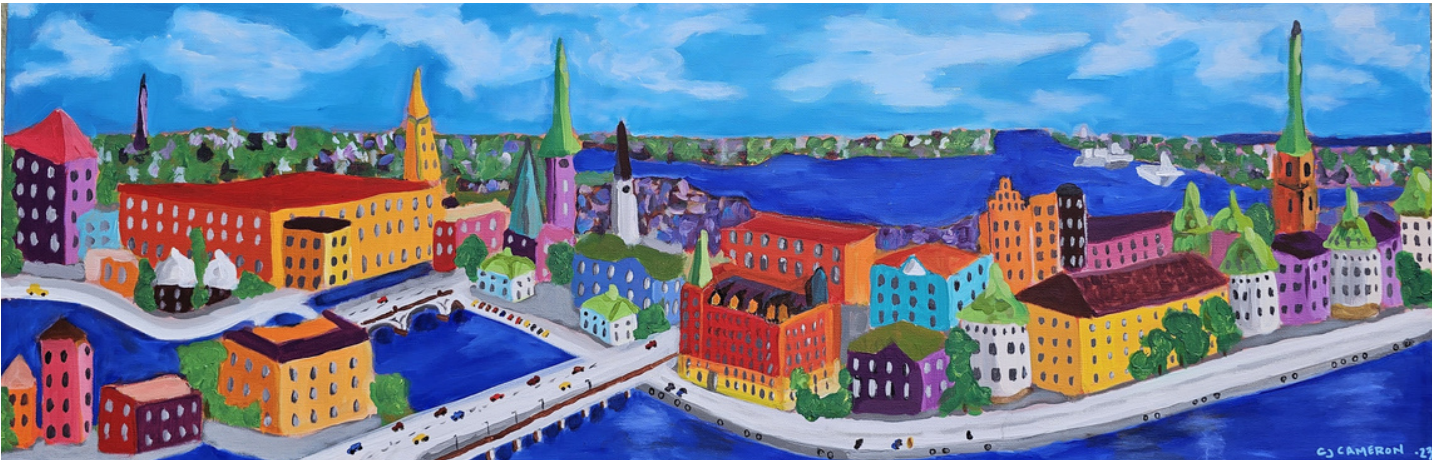
Carole Cameron - Stockholm from Our Room acrylic, 36 x 12