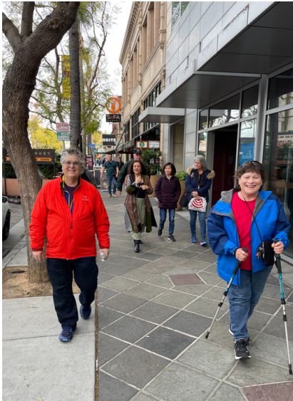
Strolling San Jose's South First Fridays art walk in April