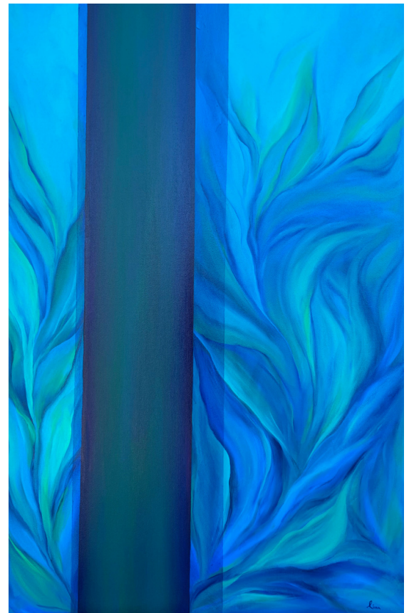
Lina Melkonian - Shades of Springtime oil, 24 x 36