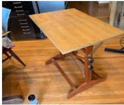
Wooden drafting table

Best offer, all proceeds go to EVA, contact juliacline@sbcglobal.net