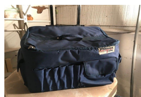
Roller bag, misc mats & sleeves