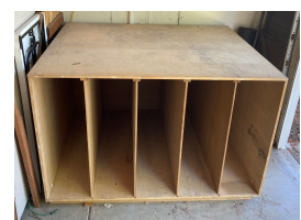
Slatted storage 40" h x 60 5/8" w x 48 5/8" d