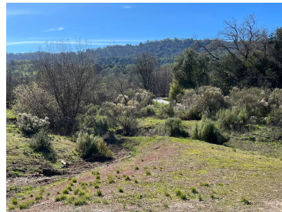
Shrubby spot at Grant Ranch